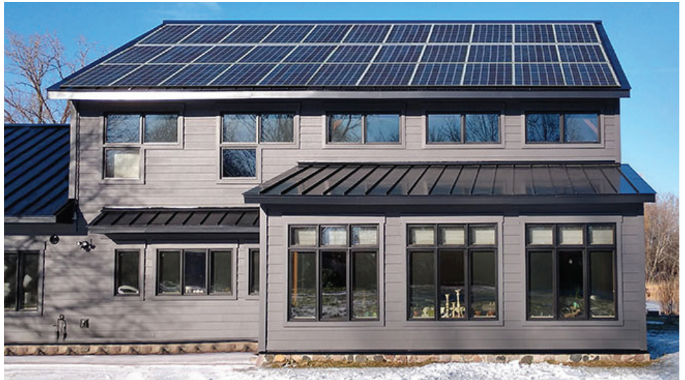
Rendering of Installation with Traditional Panels