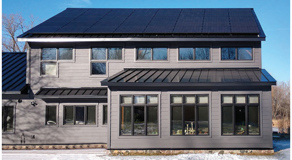
Actual Solaria PowerXT Installation

With 20% more energy per square meter than traditional solar panels, Solaria's advanced PowerXT<sup>®</sup> panels generate maximum power in minimum space.